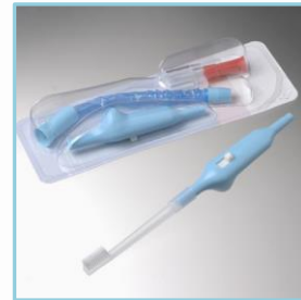
Oral care kit