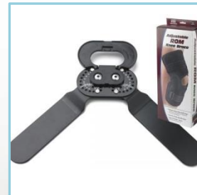
Range-of-Motion knee brace hinge