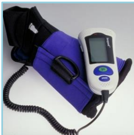
Isometric PT knee exercise controller